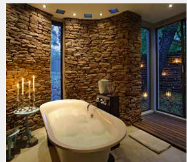
TABLE OF FACTS